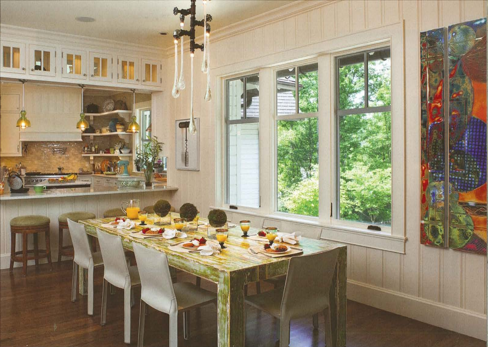
The Pickwick paneled dining room has a period feel, but provides a suitable backdrop for several pieces of the Orecks' collection of contemporary art. The centerpiece is a table by local artist Randy Shull. In the kitchen, Wildwood Studios fashioned the custom cabinetry, appliances and fixtures are by Ferguson, Mountain Marble provided the island's marble and the quartz composite countertops.

standpoint, the house is really efficient," notes Al Platt. "The rooms that radiate out from the center are one room deep. During a normal day, anywhere in the house you don't have to turn on a light." Sun tubes drop into the interior's low light areas, such as hallways and baths, to supplement the light provided by the windows.