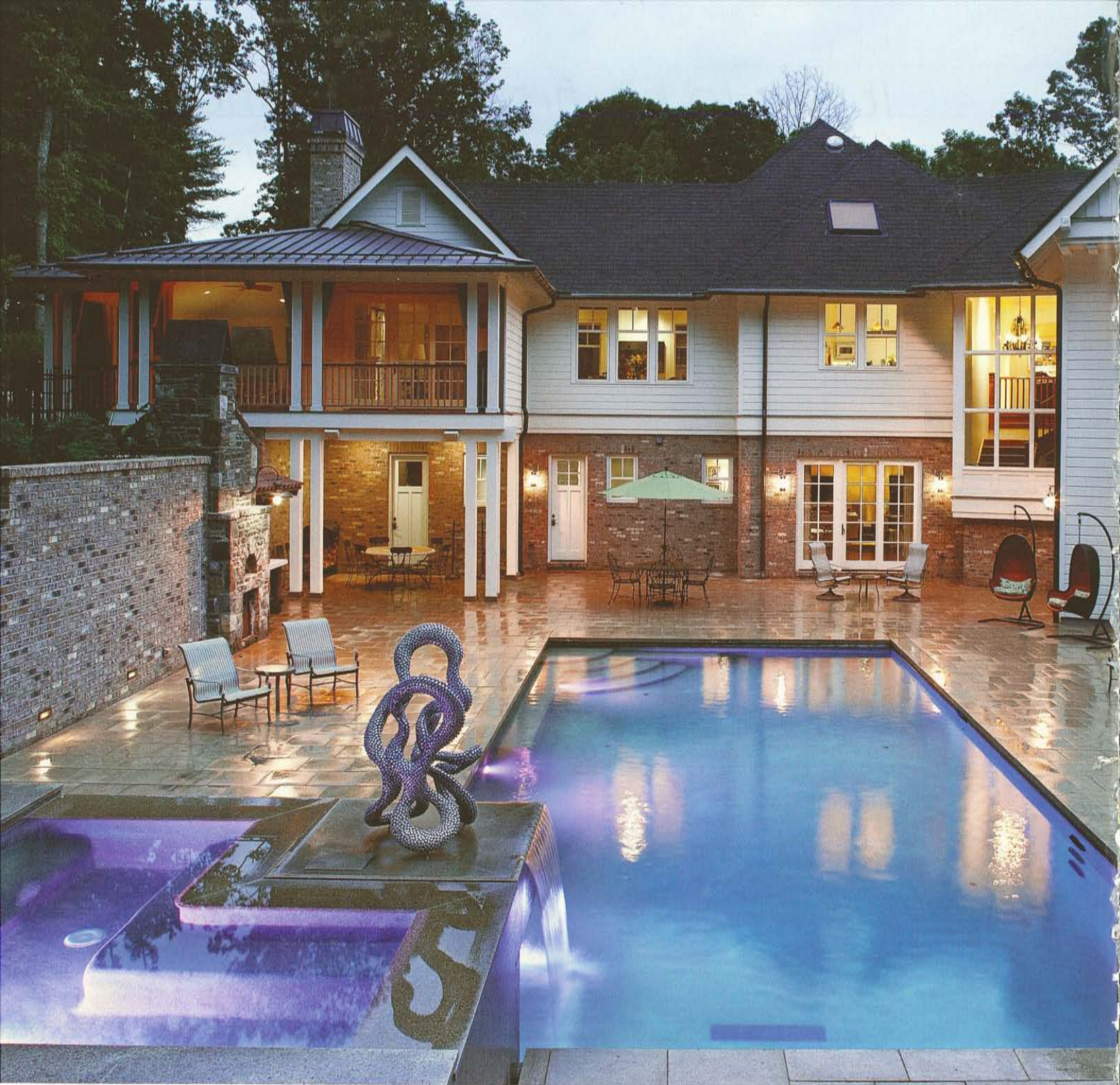
The serene grotto pool by Medallion Pool of Asheville is an engineering marvel. Geothermal heating allows the Orecks to use the pool for an extended season with lower operating costs. An automated cover is completely concealed by the granite wall at the flick of a switch.